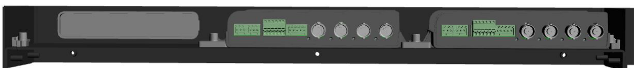
Rear View of 19" rack mounting